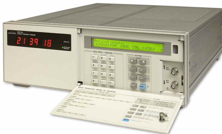
5071A Primary Frequency Standard

The 5071A offers exceptional stability and is the first cesium standard to specify its stability for averaging times longer than one day. The instrument takes into account environmental conditions that can heavily influence a cesium standard's long-term stability. Digital electronics continuously monitor and optimize the instrument's operating parameters.